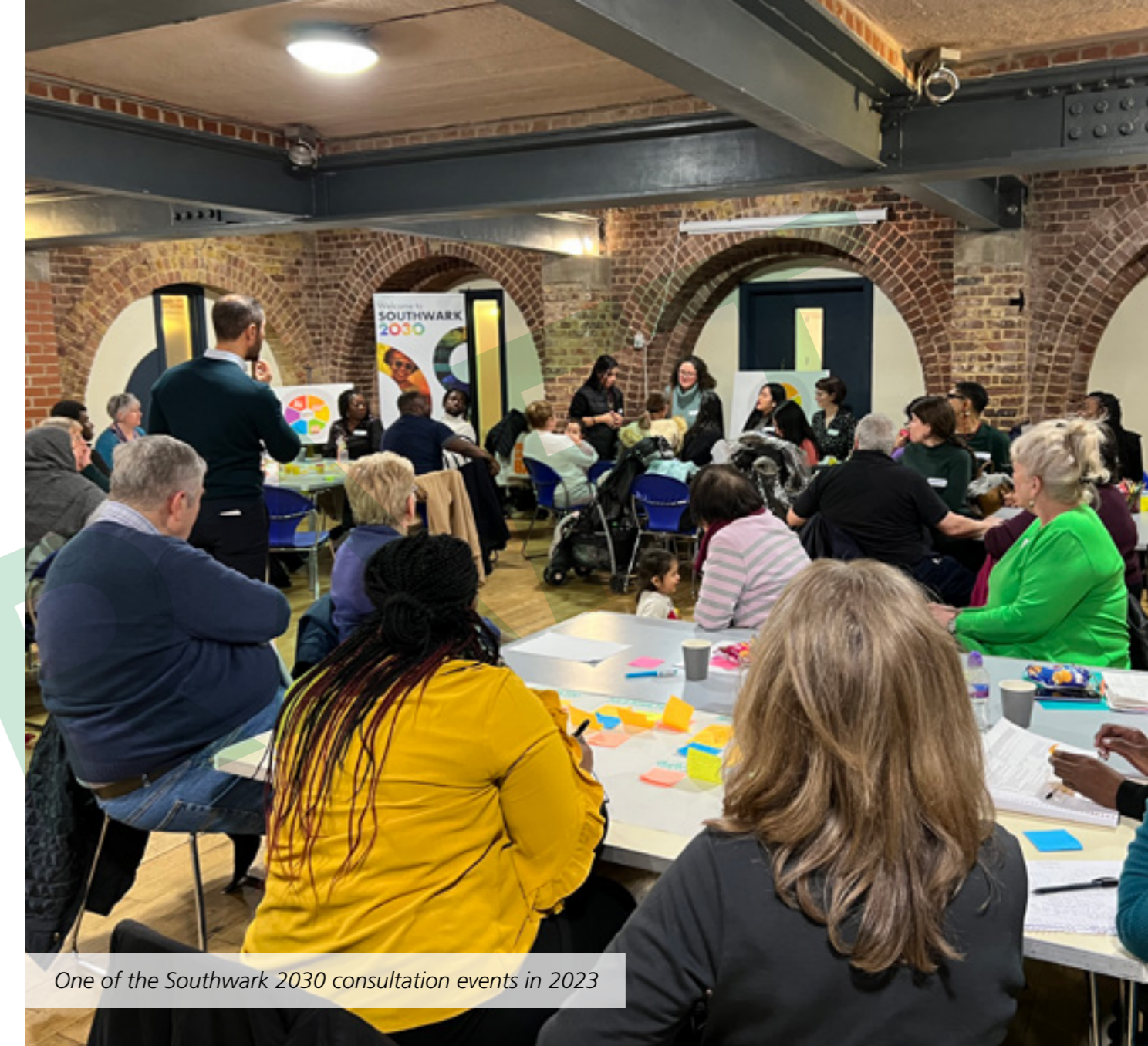
One of the Southwark 2030 consultation events in 2023

To deliver our vision and goals, we will need to reimagine how we do things and the way we work together. This strategy sets out the work we will do together.