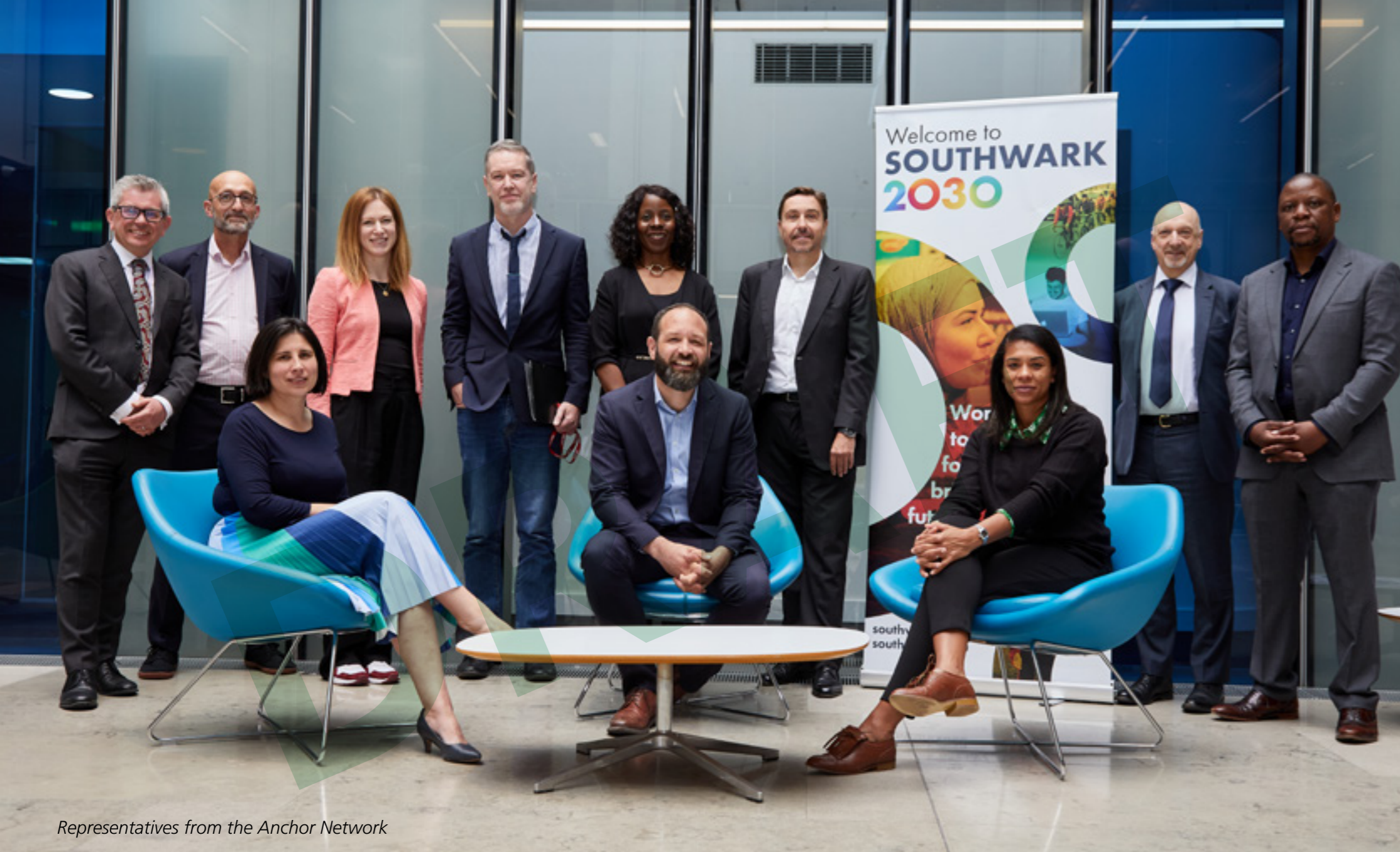
Representatives from the Anchor Network