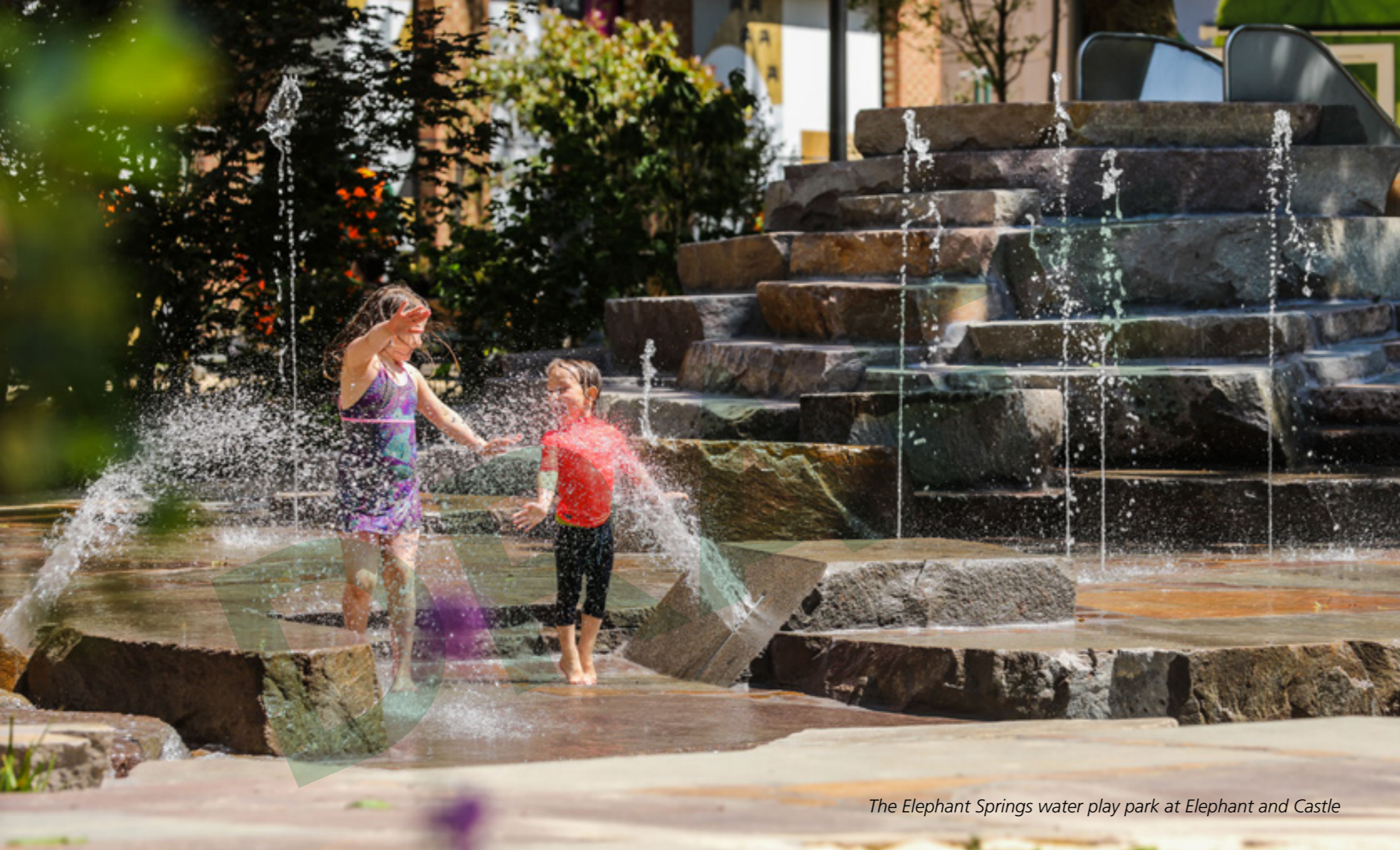
The Elephant Springs water play park at Elephant and Castle